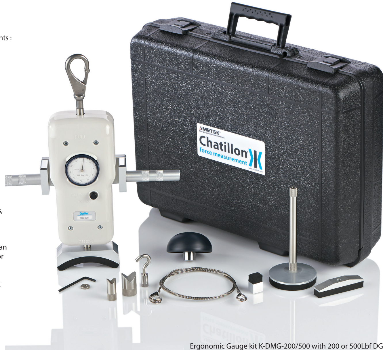
Ergonomic Gauge kit K-DMG-200/500 with 200 or 500Lbf DG Gauge

Read the detailed brochure online to see the different types of kits available.