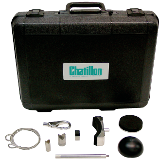
MSCK Accessory Kit